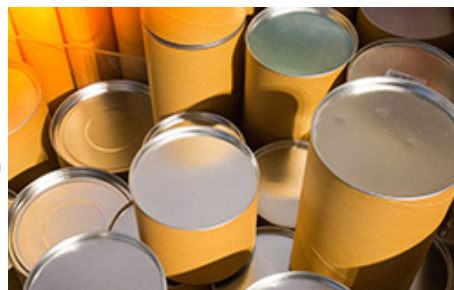
Incoming Raw Materials Inspection

ted production technology, providing excellent unit-to-unit reproducibility and temperature stability, which is critical for customers who are looking to for the ability to transfer methods from one handheld instrument to another.