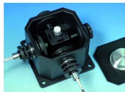
Figure 2. CUV-UV/VIS-TC-Temperature controlled

While similar to typical UV/Vis measurements, in a fluorescence measurement configuration, the excitation port and the collection port must be orthogonal (at 90 degree angles) to each other, as shown in figure 2, to prevent transmitted light from the excitation source from overpowering the fluorescence signal. When utilizing this fluorescence measurement configuration, the port in line with the excitation source might be left open