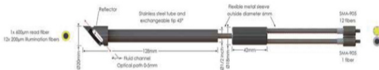
Figure 3. FCR-UV200/600-2-IND – Fluorescence probe from Avantes.

While cuvettes work well for many applications, it is not always desirable to remove a sample for testing purposes. When testing liquid or powder samples, one alternative is to utilize a fiber optic fluorescence probe like the one shown in figure 3. These probes use a bifurcated design allowing the excitation source to be coupled to one leg and the spectrometer to the other leg. While these probes can utilize many different internal fiber configurations, for example, twelve 200-micron core fibers surrounding one 600-micron core fiber as shown in figure 3, they all have one thing in common, and that is the excitation and collection paths at the sample are both colinear. This geometry dramatically simplifies the probe design allowing for a compact form factor, but it does result in increased excitation signal collection compared to the orthogonal approach utilized by a cuvette holder.