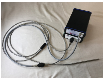
Figure 4. Typical set-up fluorescence probe

which allow the user to filter the signal on both the excitation and collection paths. Typically, placing a bandpass filter in the excitation line, and only allowing light in the excitation band into the probe will accomplish this. Since there is no such thing as a perfect filter, however, it is often necessary to add a long pass filter on the collection path to further reduce the excess light from the excitation source. Figure 4 shows an example set-up where the FH-DA direct attach filter holder is attached