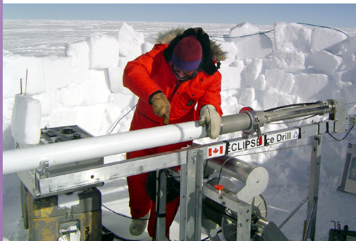
Polar Ice Research

spectroscopy to study the composition of ice core samples contributes to our understanding of the role of atmospheric carbon dioxide (CO2) on Earth's climate.