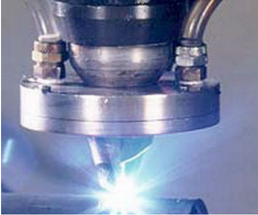
Laser Ablation in LIBS Measurements

Laser Induced Breakdown Spectroscopy employs a laser to ablate a microscopic layer of a sample resulting in a plasma that emits light as it cools. This light can be collected and analyzed with a spectrometer for quantitative and qualitative material analysis.