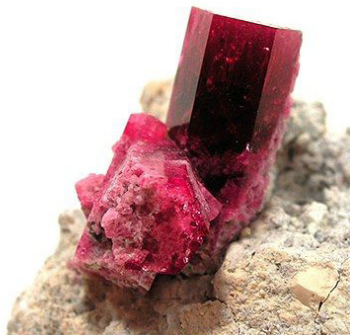
Beryl Samples for Characterization

used in semiconductor wafer and coating characterization and quality control. As a minimally destructive techniques, LIBS may be used in gemstone validation and characterization. Laser beam shaping allows for micro ablations of materials such that the measurement spot size is 50 microns in diameter. LIBS is superbly suited to the requirements of the mining and metallurgical industries