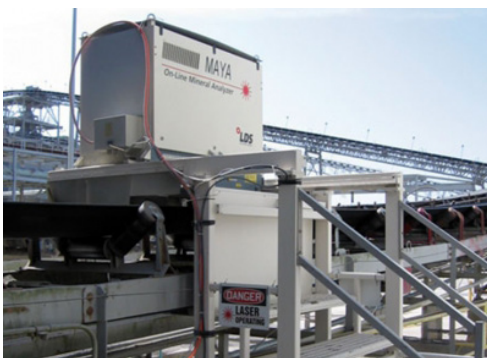
Mineral Automated Yield Analyzer MAYA

USB2 spectrometer by Avantes . The AvaSpec-ULS2048 features an ultra-low straylight, symmetrical Czerny-Turner spectrometer with a linear 2048 pixel array CCD detector. This spectrometer is often chosen for LIBS measurements, especially in a multi-channel or arrayed configuration. The AvaSpec-ULS2048 spectrometer is popular for use in applications in the physical sciences, from geology and metallurgy to environmental and climate science measurements.