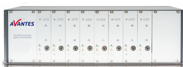
Avantes 10 channel rackmount spectrometer

Avantes unique multichannel fiber optic spectrometers provide an excellent alternative to more expensive traditional optical emission spectroscopy technologies. Avantes instruments can easily be configured in an array such that each instrument "channel" covers a short wavelength range with very high resolution. The array of instruments may cover 190-2500 nm with each spectrometer covering a 200-300 nm bandpass. Typical configurations offer resolution as low as 0.08 nm (FWHM) in the UV and all the instruments are converged together using fiber optic cables which terminate in a common connector which is positioned at the wall of the vacuum chamber. Fiber optic vacuum feed throughs may also be used to measure closer to the plasma within the chamber. The entire system is irradiance (intensity) calibrated against a NIST traceable source so as to facilitate comparability of data from one instrument to the next and enable variable integration times across the channels for optimal dynamic range. For more information about plasma measurements and optical emission spectroscopy contact an Avantes Sales Engineer at infousa@avantes.com in the Americas.